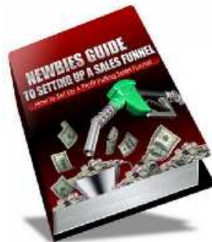
Newbies Guide To Setting Up A Sales Funnel

How to start and build a money making email list of hungry subscribers you can mail out to anytime you want.