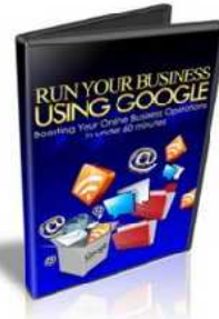
Run Your Business Using Google

Discover The Secrets To Generating More Traffic, Leads, and Sales By Piggy-Backing On High Traffic Social Media Websites. Using These 77 Powerful Tactics, You'll Generate An Unlimited Amount of Traffic To Your Websites!