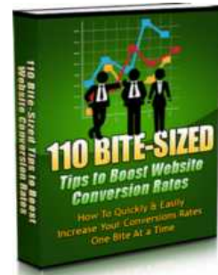
110 Bite-Sized Tips To Boost Website Conversion Rates

Writing killer E-Mails is an essential survival skill in Internet Marketing. If you don't develop the skill, you won't be able to survive. Invest in learning this priceless skill now and guarantee your future success!